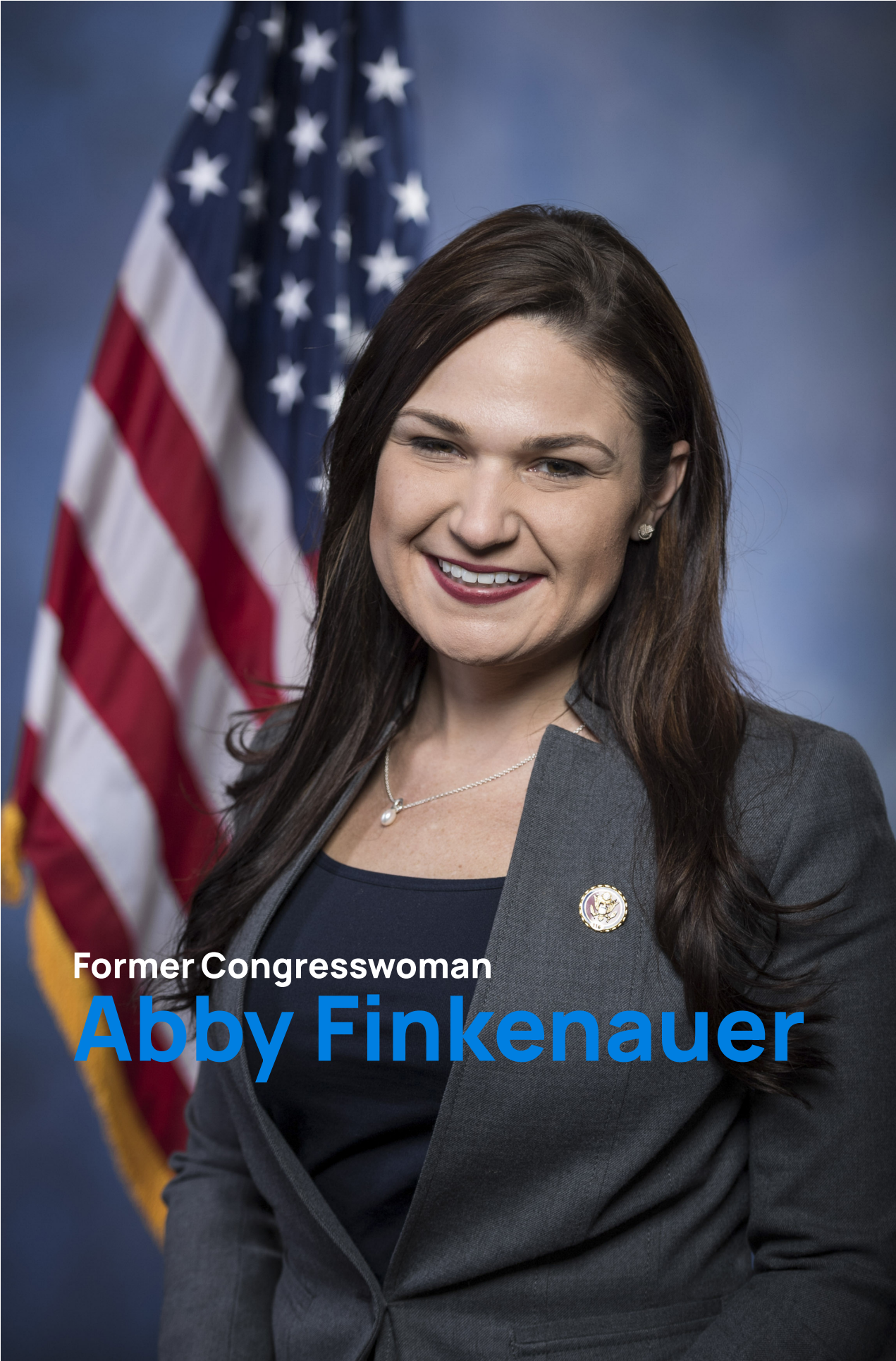
Former Congresswoman Abby Finkenauser